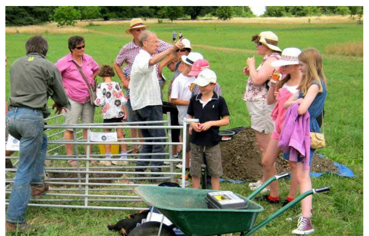
The ice creams are over there! Visitors to the test pitting at Wimpole during the hot summer