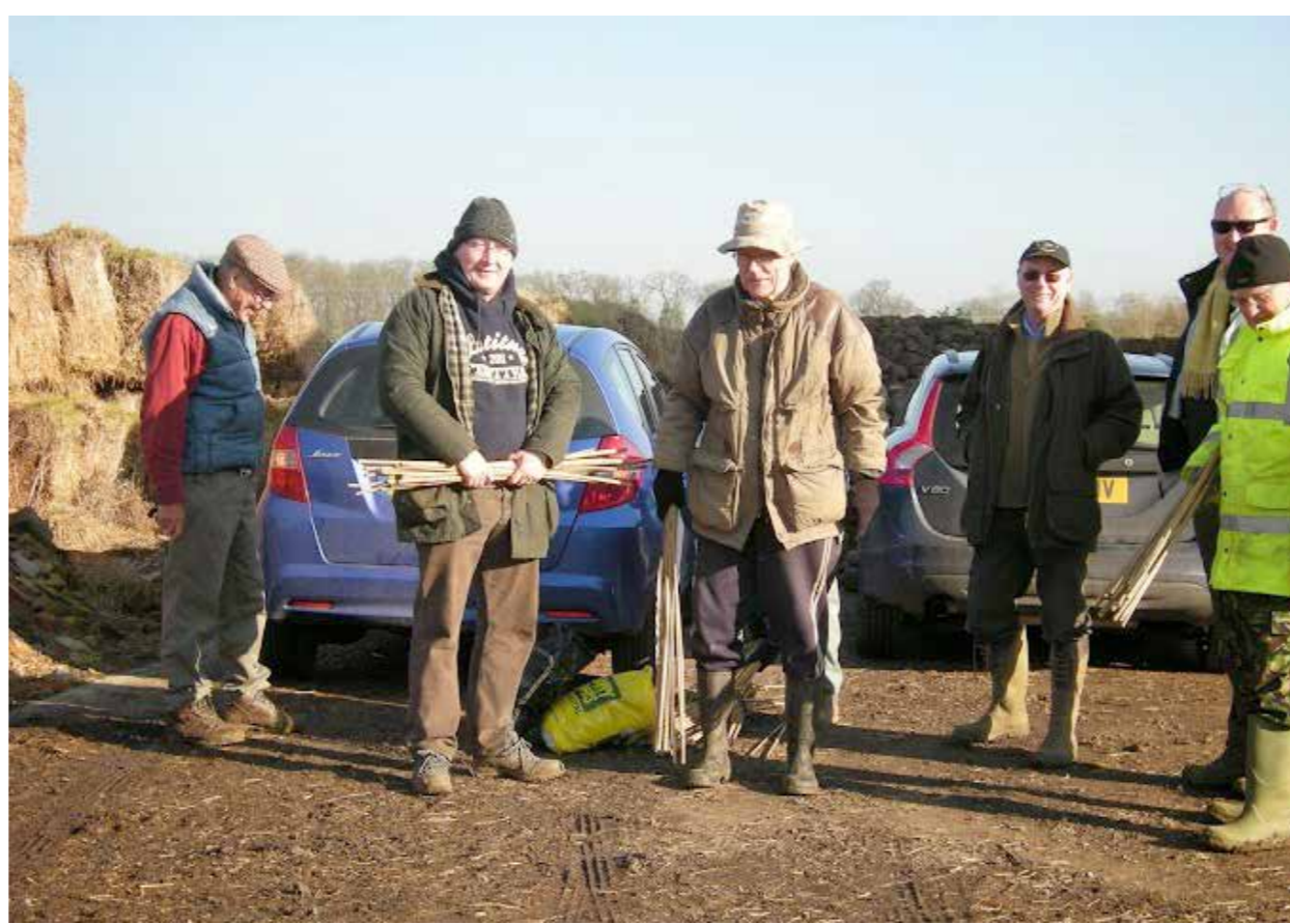
The group ready for action – Cambridge Road Farm