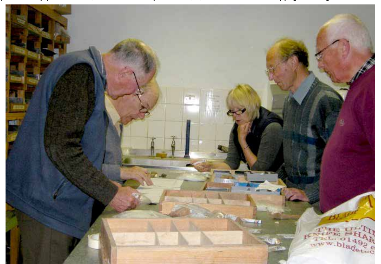
How many pieces? – sorting out the finds