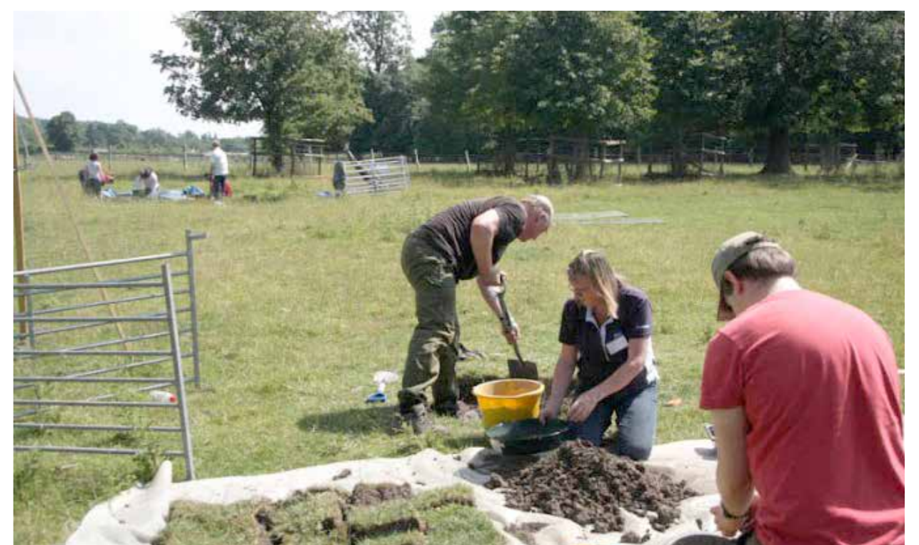
You in your small hole and me in mine – volunteers helping out at the Wimpole test pits