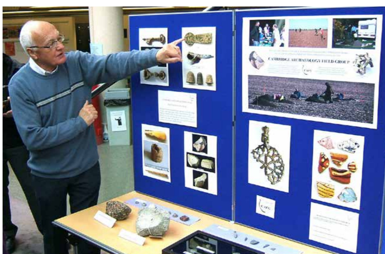
If you look closely ..... Poster presentation at the CAS conference, Cambridge