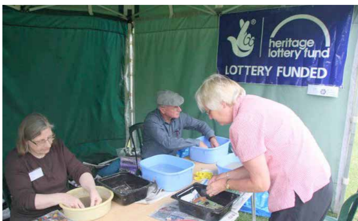
Helpers washing the test pit finds in the tent at Wimpole