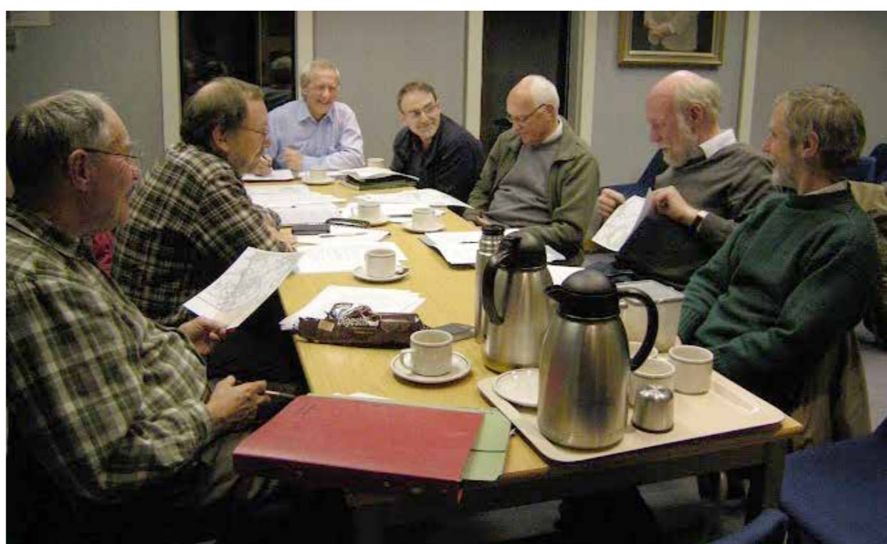
Serious discussion of what to do next – the committee at work