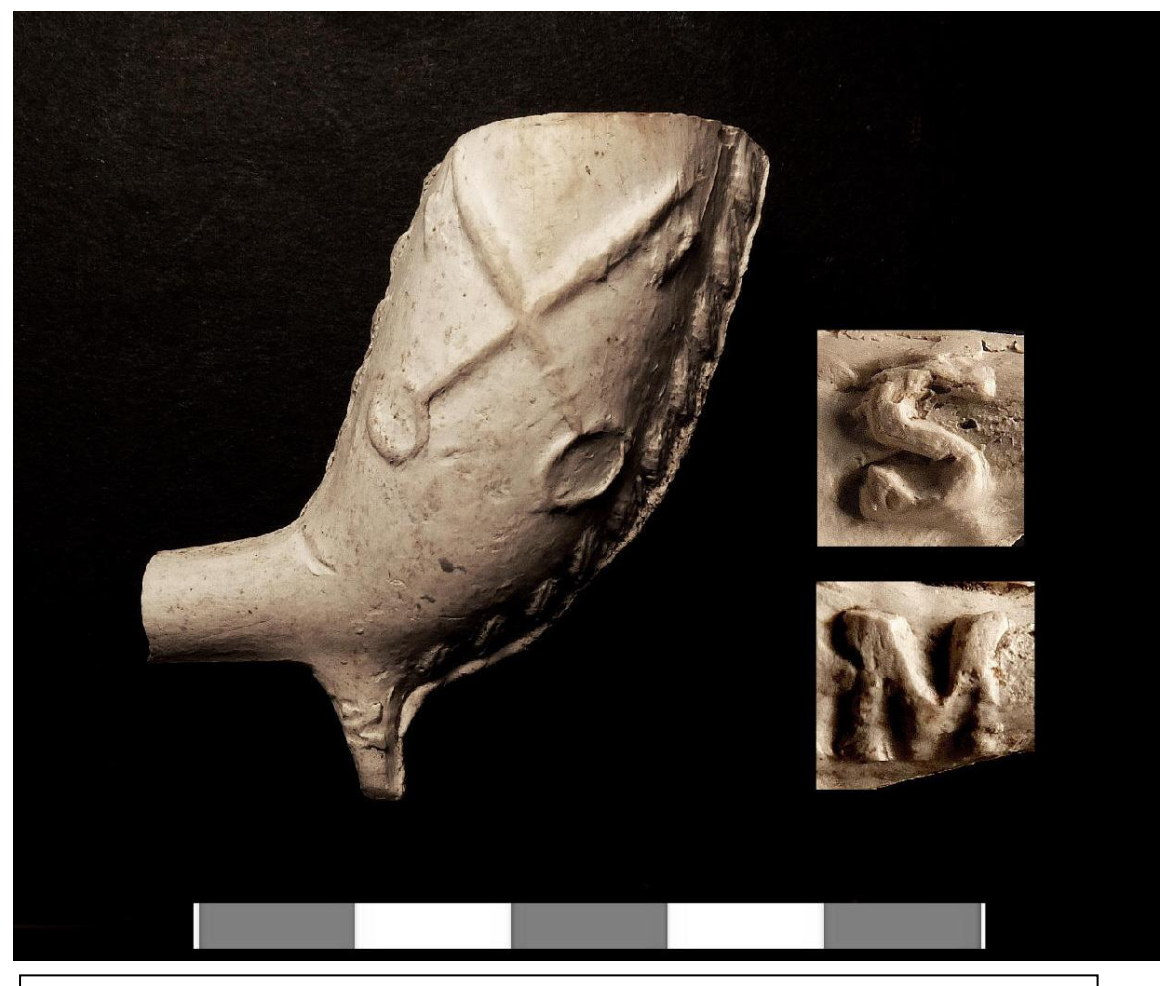
Photograph 2 Photograph showing the decoration on the Walled Garden pipe.

This type of pipe was an early form of advertising. However, the cross keys symbol is also the sign of St. Peter in the Catholic Church (he was said to be the gatekeeper to Heaven). Also crossed keys are the symbol used on Masonic regalia for the treasurer of the Lodge. However, the pub source is most likely with a number of pubs of that name in the area, including one in Magdalene St. in Cambridge. The Cleaver family are known to have produced pipes with this decoration at their Newmarket Road base while an unknown maker from St Neots produced them as well (Flood, 1976).