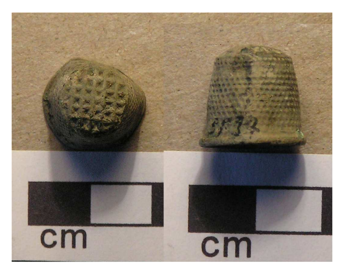
Figure 2. (a) Left hand side - view of the waffle shaped crown. (b) right hand side - view showing the upright sides and flatter crown, the regular concentric rings of indentations and the pronounced rim around the base.

These features all suggest a date in the 17<sup>th</sup> to 18<sup>th</sup> century range, according to the article.