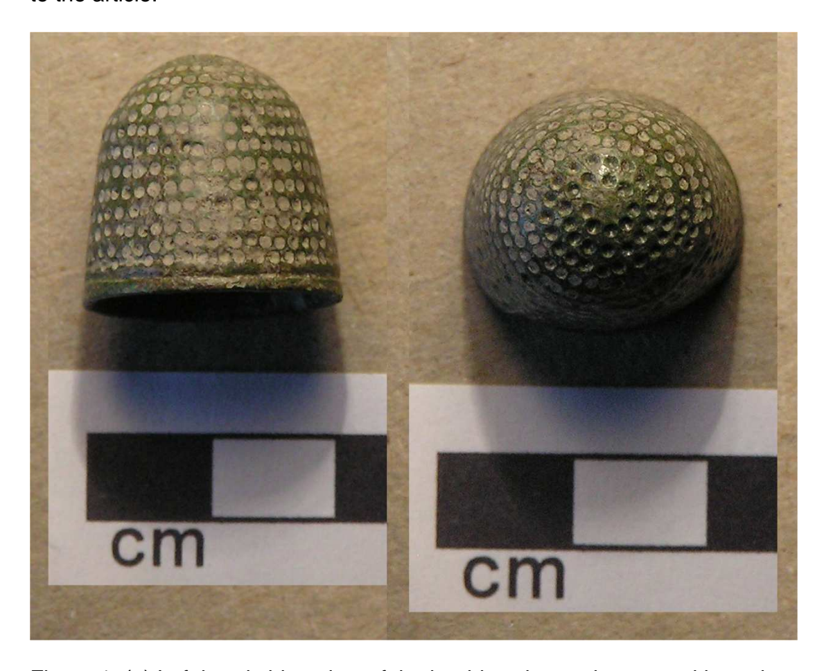
Figure 1. (a) Left hand side - view of the beehive shape, the manual irregular indentations and the scribed band around the base. (b) right hand side - view showing small tonsured crown and spiral indentations.

These features all suggest a date in the 14<sup>th</sup> to 16<sup>th</sup> century range, according to the article.